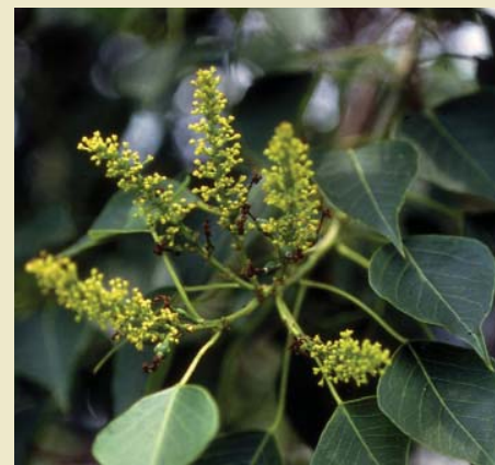
Chinese tallowtree ( Sapium sebiferum )

Watch List B: Exotic plant species that are severe problems in surrounding states but have not been reported in Tennessee.