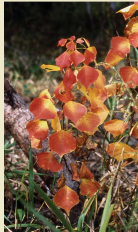
Chinese tallowtree ( Sapium sebiferum ) with fall foliage