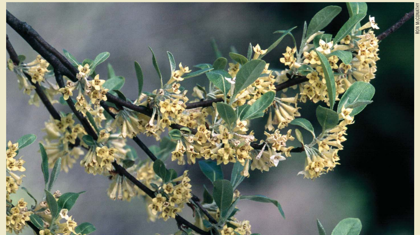
Autumn olive ( Elaeagnus umbellata ); Rank 1 – Severe Threat

This list has no regulatory authority but provides useful information to help guide agencies and private landowners in making responsible decisions about plant use and management decisions. The Council acknowledges that most introduced species are harmless. However, it also realizes that many species do naturalize and have the potential to spread and become ecological disasters.