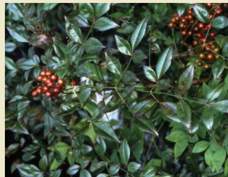
Nandina ( Nandina domestica )

Rank 2 – Significant Threat: Exotic plant species that possess characteristics of invasive species but are not presently considered to spread as easily into native plant communities as those species listed as Rank 1.