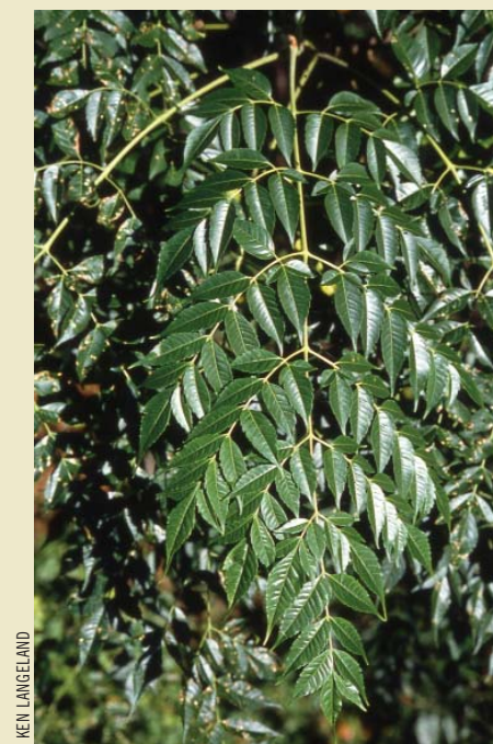
Chinaberry ( Melia azedarach )