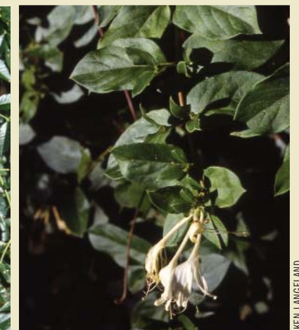
Japanese honeysuckle ( Lonicera japonica )